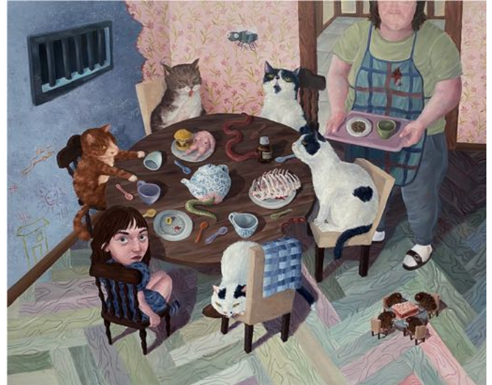
Rei Xiao, It Was Dark Inside The Wolf, 2022 Oil on canvas, 121 x 152 cm