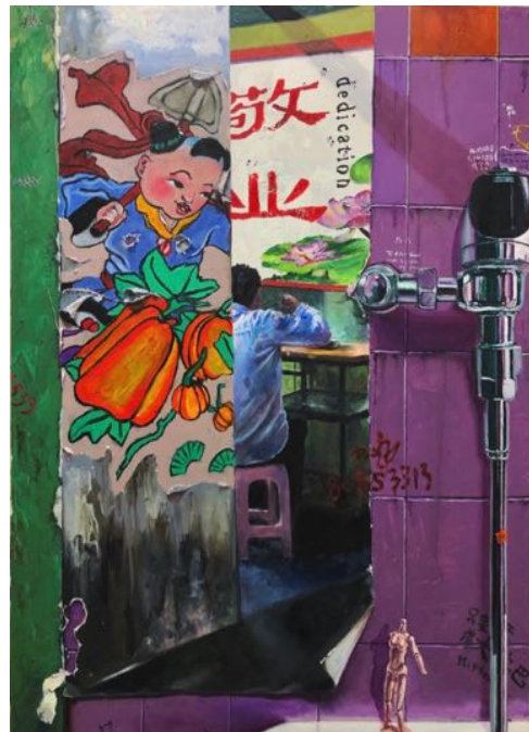
Yuxiao Ran The Conceptual Impossibility Of Work In The Mind Of Someone Pissing, 2019 Oil and acrylic on canvas, 101.6 x 76.2 cm

As many of the works are being produced exclusively for the show only a limited amount of pieces are listed. Please use any of the images for press releases. If you require any further information please contact hello@subtitlelabs.com