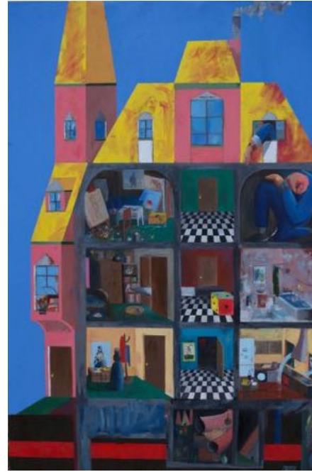
Pau Aguiló "Jack's Place", 2022 Oil on canvas, 135 x 95 cm