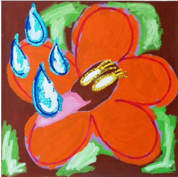
Eilen Itzel Mena Cooling Elixir, 2020 Acrylic, oil pastels and sequins on canvas, 76 x 76 cm