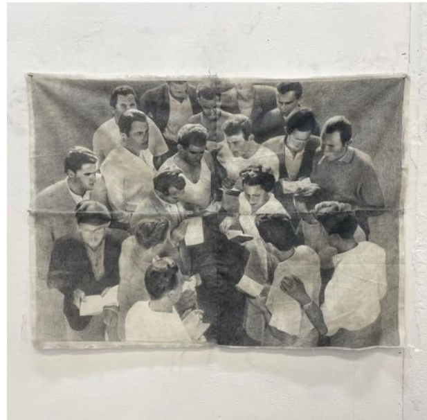
Georgia Germani Untitled 1 Graphite pencil on four pieces of calico, stitched together, 70 x 90 cm