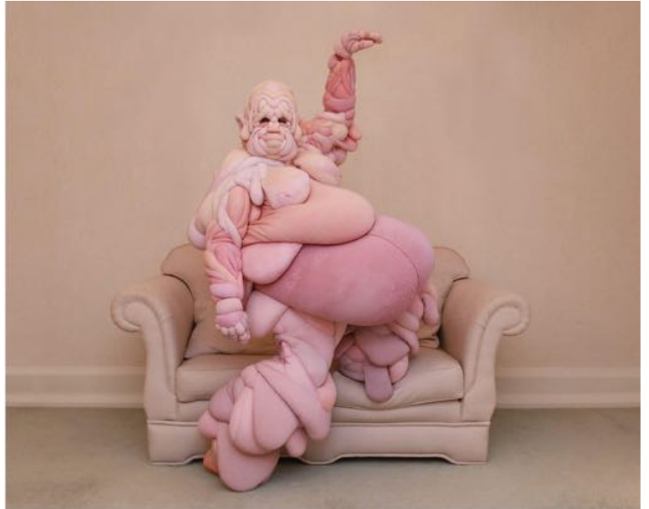
Daisy Collingridge "Burt Feels Like This", 2018

In partnership with the St Quintin Centre for Disabled Children and Young People, a state of the art centre offering activities and support for disabled children, young people and their families, Subtitle will be exhibiting exclusive original artworks, with 10% of the profits going to the centre for materials for an art workshop.