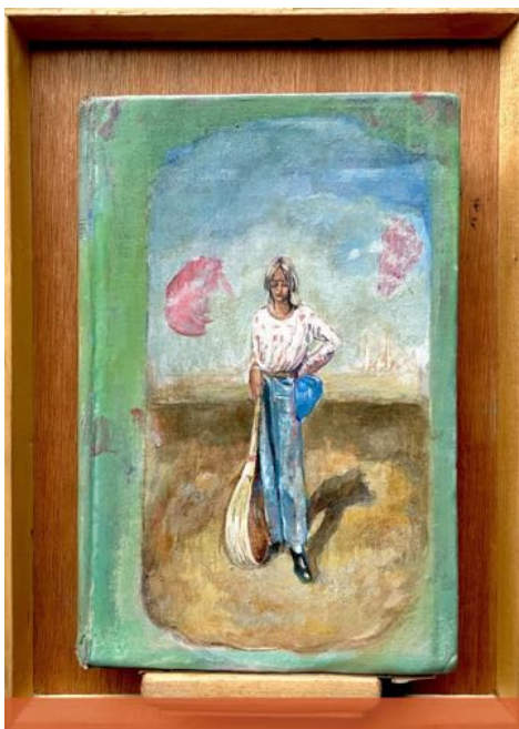
Suleman Aqeel Khilji Unwritten II, 2021 Oil on gessoed, on a found book, 29.7 x 21 cm