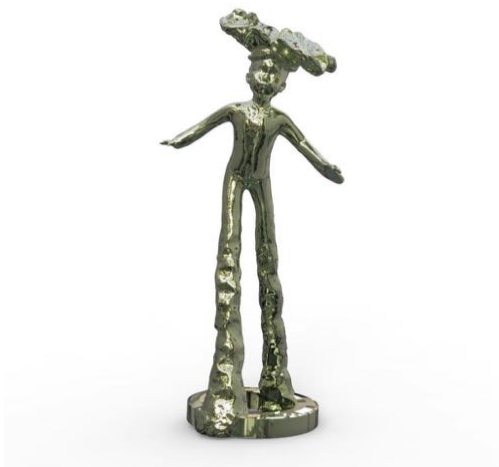
Cheuk Yiu Lo Sky, 2020 Fibre glass, 20.7 x 18 x 45 cm 91 x 91 cm